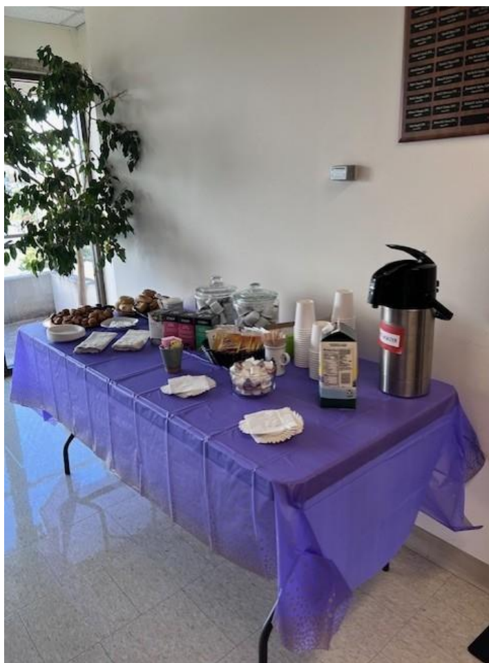
"Welcome to Fall Quarter" snack table