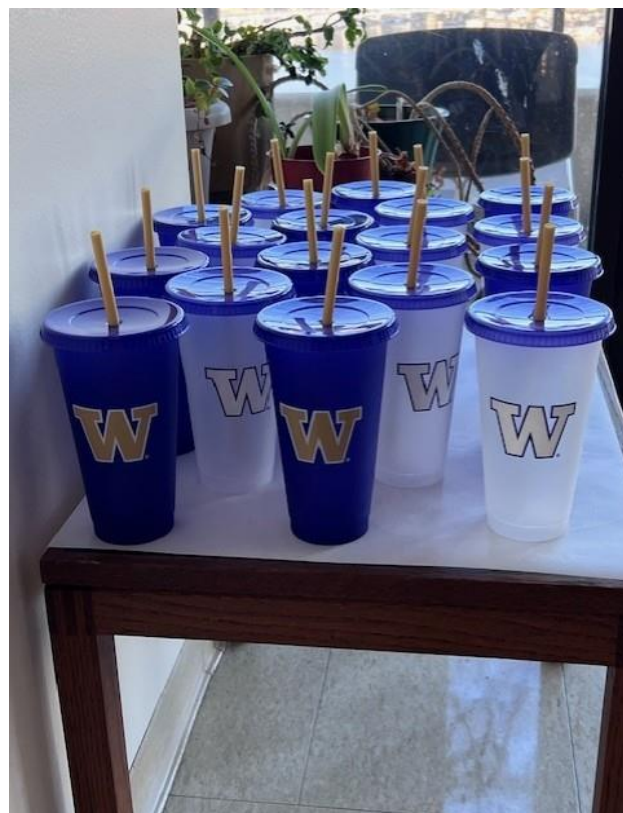
Free UW cups at "Welcome to Fall Quarter"