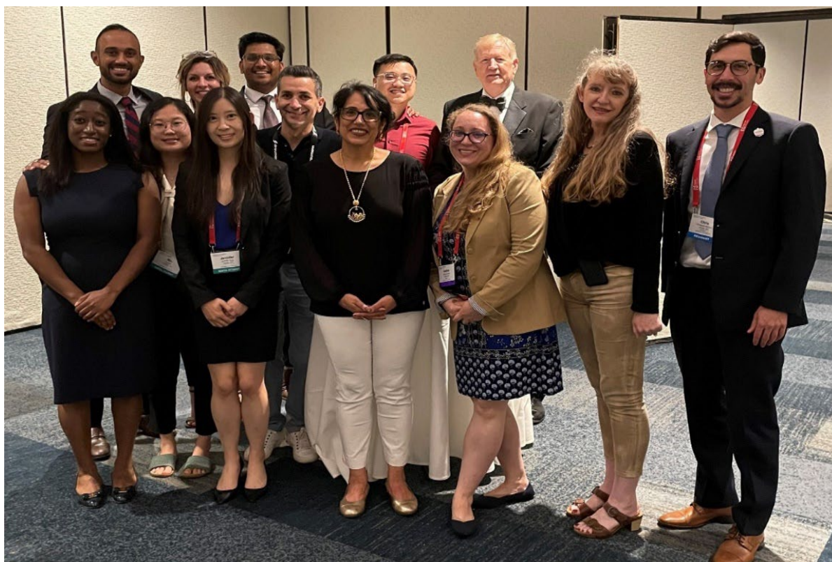
Figure 7 –AAOMS Alumni Reception 2022, New Orleans, LA