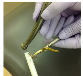
The correct method to unclog a hardened amalgam plug.

"Flaming" is an outdated and dangerous method to liquefy hardened amalgam plugs clogging carriers. When amalgam is heated with a flame, a fair amount of elemental mercury vapor is released. It is inhaled and because of its chemical nature, is easily and rapidly absorbed into the blood stream. This increases the body's burden of mercury, which is not quickly reduced because of mercury's long half-life in the body. If enough mercury accumulates, many symptoms can occur.