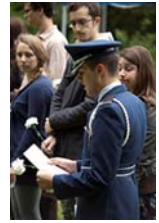
Thirteen worker fatalities were from King County in 2014.