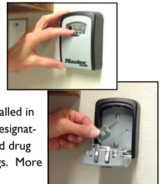
Mary K. Hagstrom from the Center for Comprehensive Oral Research demonstrates a key safe.

http://dental.washington.edu/wp-content/media/policies/clinical-policy/Comprehensive_Medication_Policy.pdf