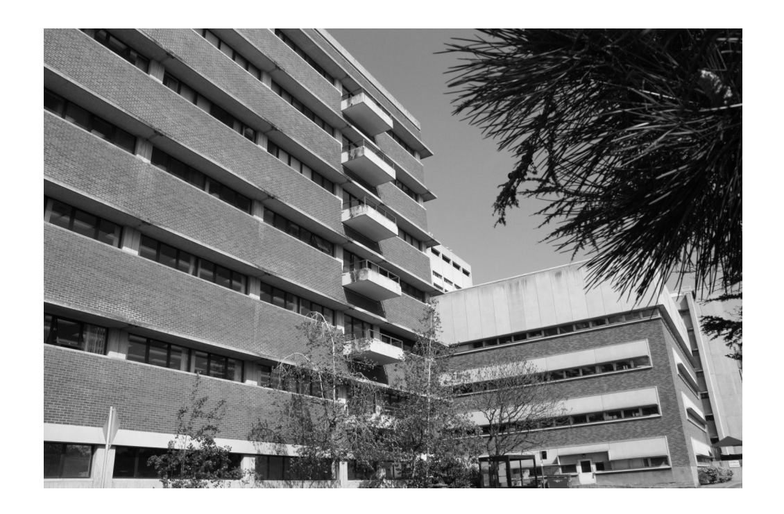
UW School of Dentistry