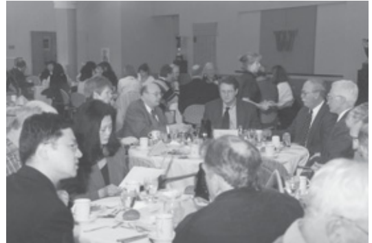
Alumni enjoy the business meeting luncheon at the lectureship.