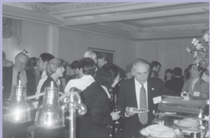
Those gathered at the Seattle Yacht Club mingle after hearing the news that $1.5 million has been raised to fund the Moore-Riedel Chair in Orthodontics.