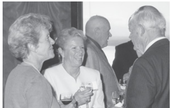
Class of 1950 classmates and spouses enjoy the opportunity to be together again.